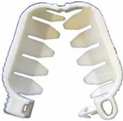
Weasand Clip for Beef - White 1012147 - 2000 in Box - Bulk 1012198 - 2000 in Box - Stacked