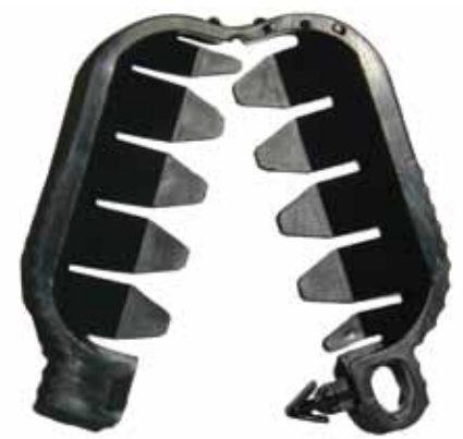
Weasand Clip for Beef - Black 1012181 - 2000 in Box - Bulk 1012194 - 2000 in Box - Stacked