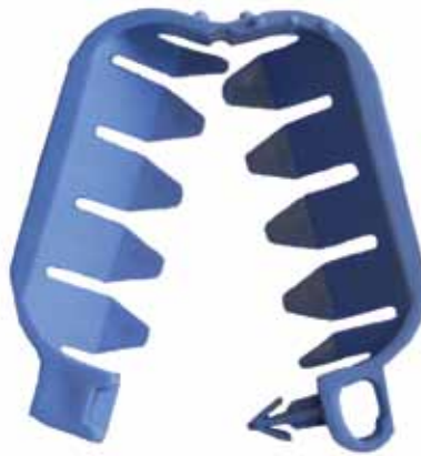
Weasand Clip for Beef - Blue 1012156- 2000 in Box - Bulk 1012206 - 2000 in Box - Stacked