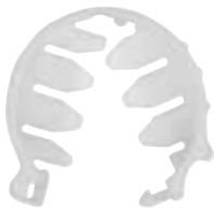
Weasand Clip for Sheep 1012135 - White - 6000 in Box - Bulk 1012173 - Blue - 6000 in Box -Bulk