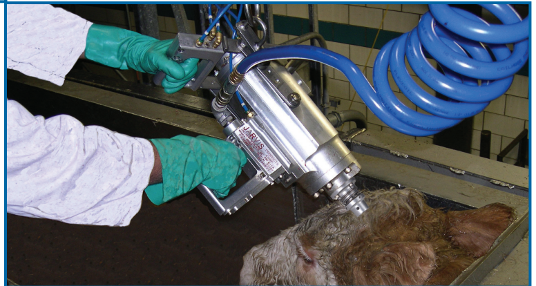
Non-penetrating stunner used with monorail restrainer.